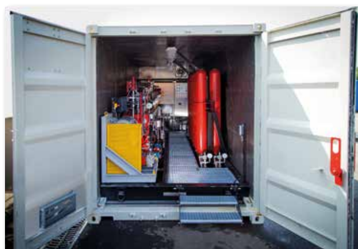
Containerized BOP Closing Unit