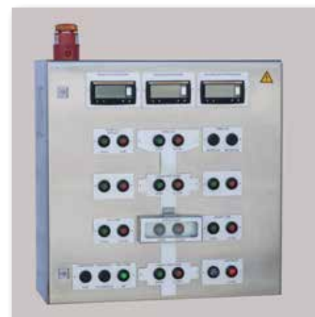
Push button hardwired Control Console