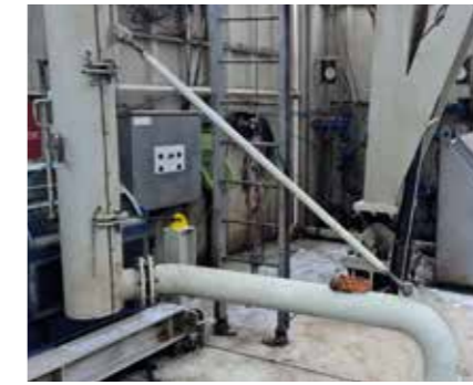
Manual operated Mud Bucket