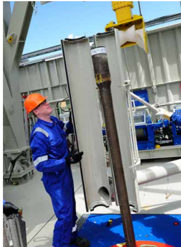
Manually operated Mud Buckets with integrated return line.