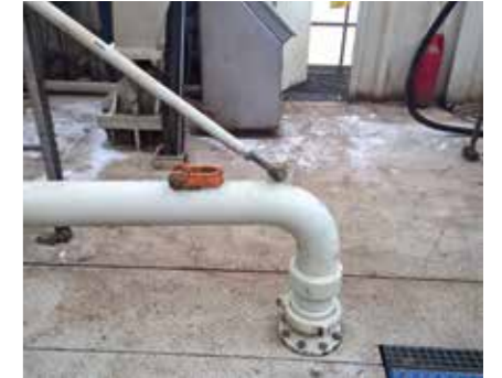
Simplified integrated mud return line with hammer union connection on the drill floor.