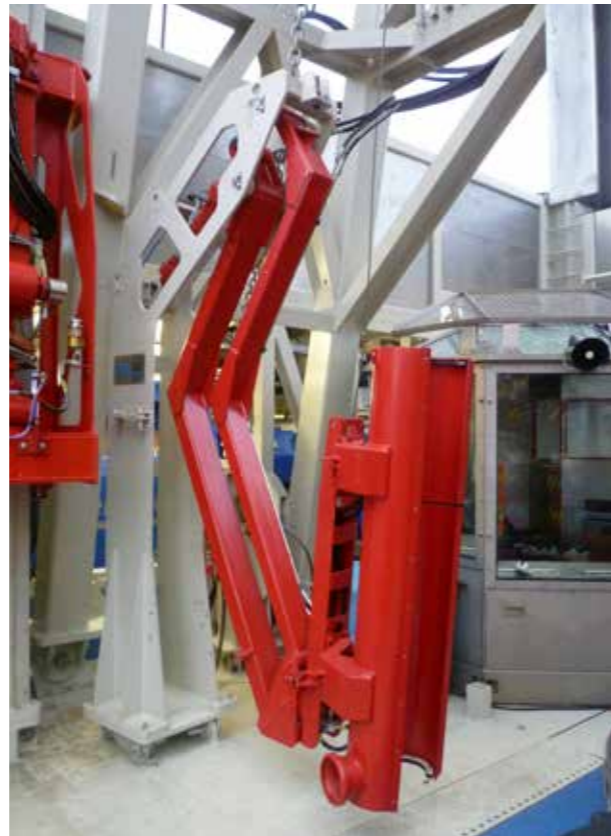
Automated Mud Bucket with external mud return line.

The Bentec Mud Bucket is a hydraulically or manually operated safety system, which prevents mud spills on the drill floor during wet trips or breaking out drillpipe connections.