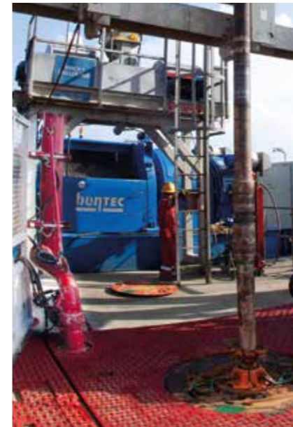
Automated Mud Bucket with integrated mud return line.

The slewing range can be integrated into Bentec, or any other rig, Zone Management System preventing collisions with other drilling equipment that is in motion.